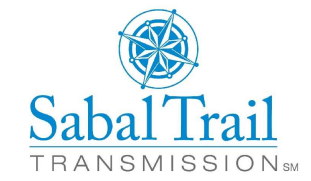
Figure 10.4-1 - Transportation System Alternatives Sabal Trail Transmission DWG NO: 1657-PL-DG-7037 SHT: 1