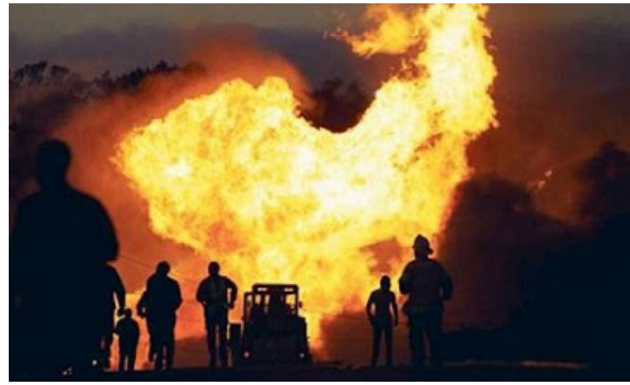
Knifley, KY (2-13-2014): A natural gas pipeline exploded in Adair County, Kentucky, destroying two homes, causing an evacuation of 20 residents, and blasting a 60-foot crater into the ground near Highway 76.

That's a total of 127 pipeline accidents!