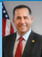
Philip Levine Mayor City of Miami Beach